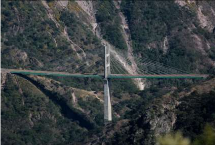
El Carrizo Bridge in Mexico.

Two checkpoints with Weigh In Motion (WIM) technology have been installed in summer 2018. The location of the sensors was determined to be before the toll stations that surround the bridge so they can pre-select the heavy vehicles and have enough space to detour those vehicles from the bridge itself. The trucks – both with and without trailers – are traveling on the bridge at average speeds of 90 km/h.