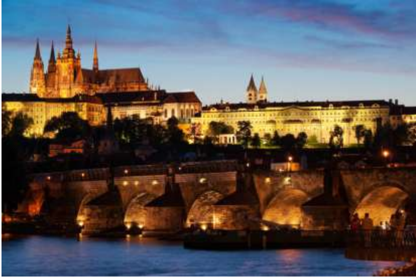
Night view of the old city of Prague, Czech Republic

ISWIM will appoint a chairperson among its members for each workshop the chair will briefly introduce the topic, introduce the speakers, take care of the time and lead the discussion. A session secretary will take notes and prepare a short synthesis of the session, to be published after the conference on the ISWIM web site. At least 15 minutes will be reserved for questions and answers.