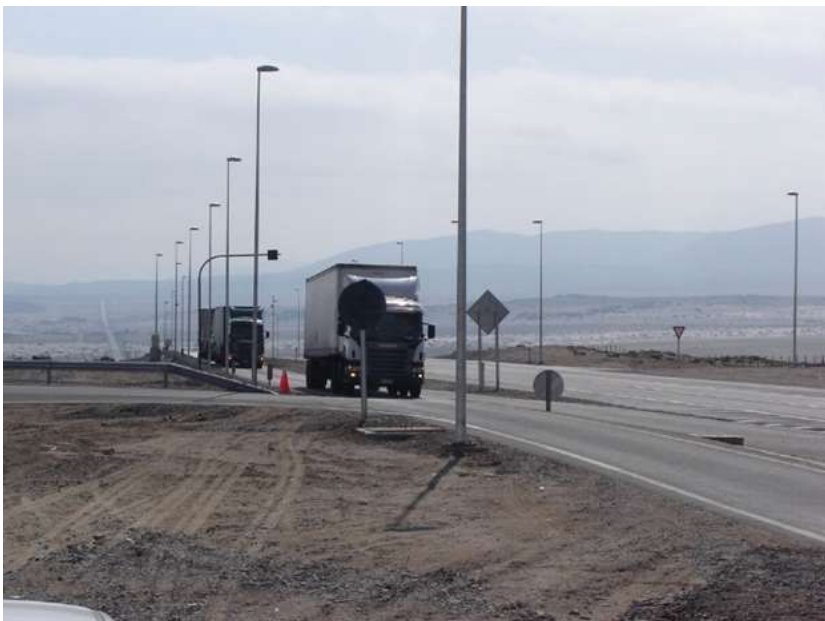
Commercial vehicle crosses the first of two WIM scales

International Road Dynamics (IRD) subsidiary PAT-Traffic Ltda. installed the first 13 weigh stations in Chile in 1982 and 1983. Since then, these weigh stations have operated 24 hours a day, only closing for maintenance. Today there are 35 PAT Traffic installed and serviced weigh stations using weigh in motion (WIM) across the country. The use of WIM has reduced overloading, increased pavement life, and reduced accidents that involve heavy trucks.